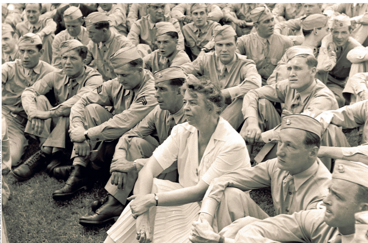
HER DAY Eleanor Roosevelt sits among uniformed servicemen at a White House party in their honor, 1942.

She had met her distant relative Franklin when they were small and played in his Hyde Park nursery, and they saw each other occasionally. As a young woman, Eleanor stood out among her Roosevelt cousins. Tall and slender, her golden hair piled on top of her head, many commented on her beauty as a debutante. She and Franklin dated. When he was a senior at Harvard he asked her to Cambridge to the Harvard-Yale game, and shortly thereafter asked her to marry him. She unhesitatingly accepted.